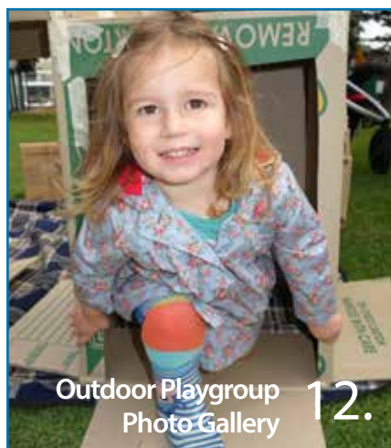
Outdoor Playgroup Photo Gallery

Playgroup SA 1800 171 882 www.playgroupaustralia.com.au