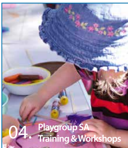
04. Playgroup SA Training & Workshops