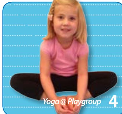
Yoga @ Playgroup